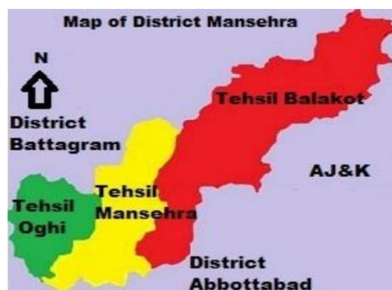
Figure 1. Map of district Mansehra

The current investigation was executed in three tehsils of district Mansehra viz; Mansehra, Balakot and Oghi as presented in the following map (Fig. 1).